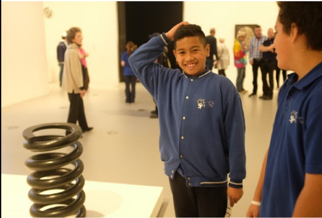
I'm confused. This is not what I thought I'd be seeing in an art gallery!