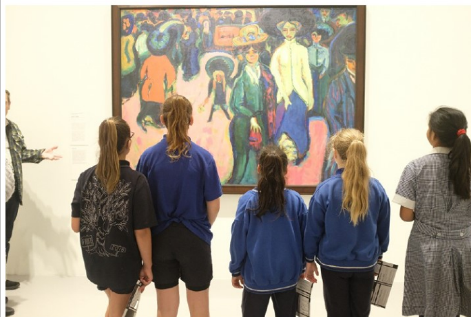
Our guide discussed this piece with us. We talked about the bright colours not being used to show happiness but rather disillusionment with the new modern world.