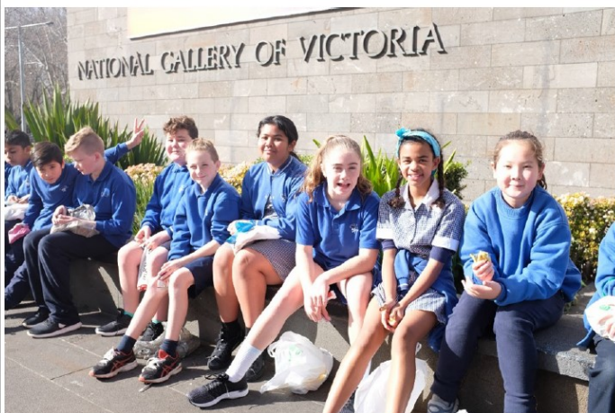
Enjoying the Melbourne sunshine before heading inside to learn about modern art.