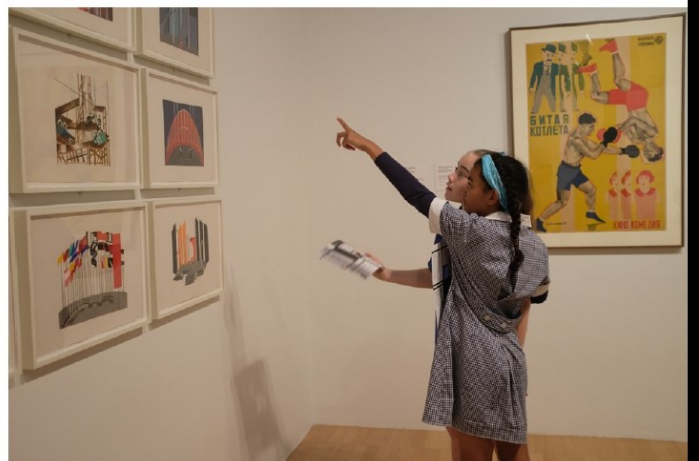
Grade 5 students enjoying the art work of Alexandra Exter who designed theatre sets.