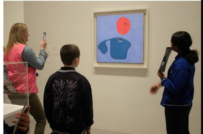
Enjoying abstract art.